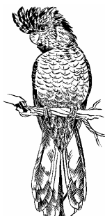
Yellow-tailed Black Cockatoo MT ©

Whether you are relaxing in the picnic grounds or taking a stroll along the walking track, keep an eye out for many native birds that frequent the area. Laughing Kookaburras, Crimson and Eastern Rosellas, King Parrots and Yellow-tailed Black Cockatoos have all been seen in and around the picnic grounds. If you are lucky you may catch a glimpse of a Superb Lyrebird darting through the dense understorey.