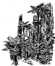
Forest MT ©

The forest surrounding the picnic grounds consists of damp to wet sclerophyll (hard-leaved) vegetation, some of which have been disturbed by fires. The canopy is dominated by Mountain Ash, Manna Gum, Mountain Grey Gum and Messmate (eucalypt) trees. The mid-canopy contains Soft and Rough Tree Ferns which provide protection for delicate fern species within the ground cover such as the Common Maidenhair, Common Rasp Fern and the King Fern.